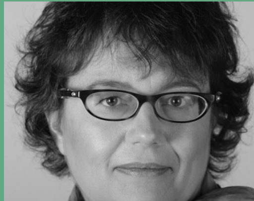
PAULA SIMONS: EDMONTON JOURNAL'S CITY COLUMNIST