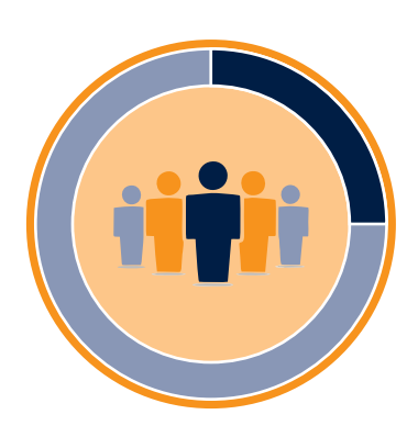
23% Candidate Member