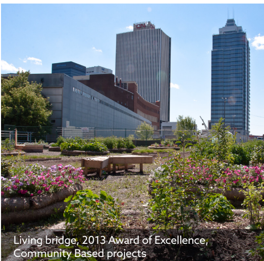
Living bridge, 2013 Award of Excellence, Community Based projects

This category is for an urban design plan or study that has already been approved or adopted by the City of Edmonton and physical changes have already started to occur.