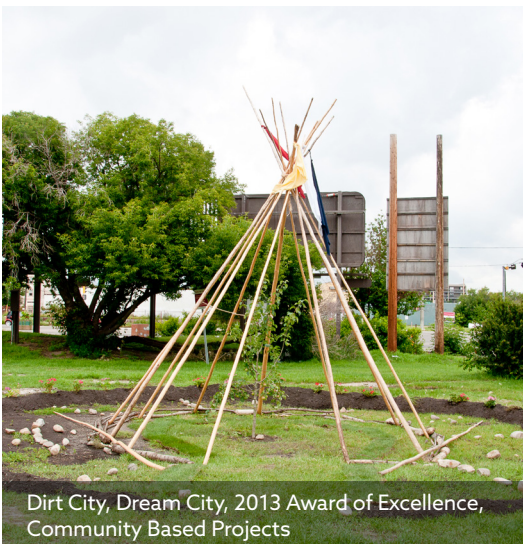
Dirt City, Dream City, 2013 Award of Excellence, Community Based Projects

This category of award will recognize a civic improvement project such as a park, a public space, civil engineering or environmental infrastructure, street furniture and lighting elements, etc., which have been implemented as the result of an urban design plan or initiative.