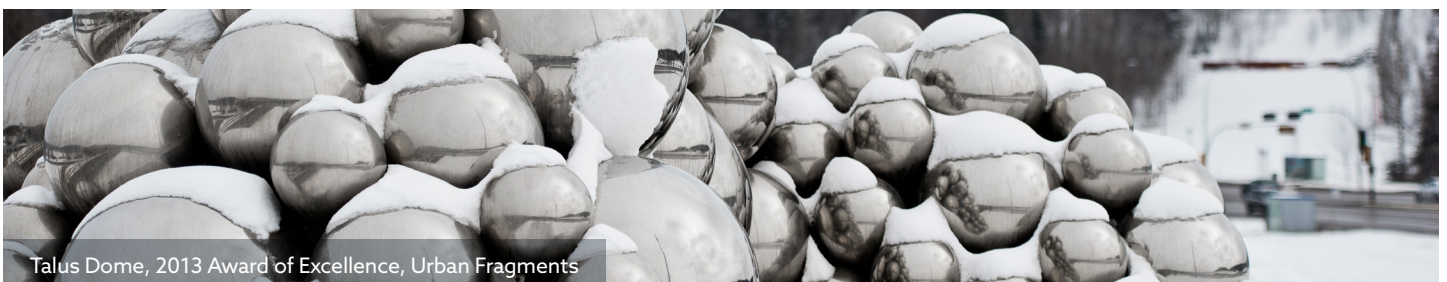
Talus Dome, 2013 Award of Excellence, Urban Fragments